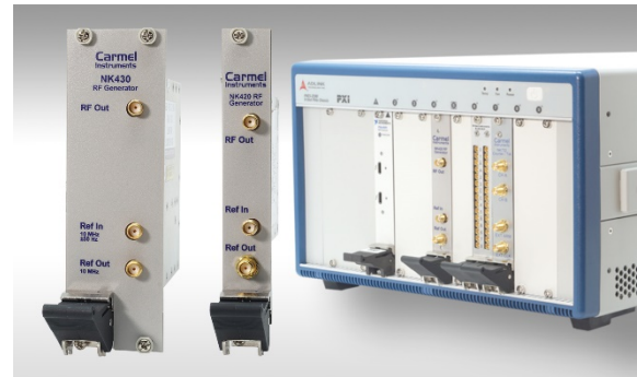
NK420 and NK430 With PXES-2590 Chassis