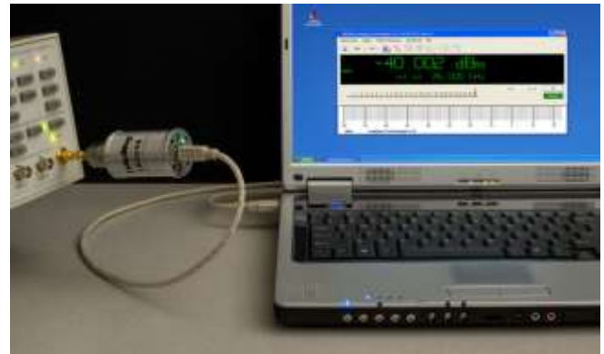
Test Setup for One Sensor Measurements