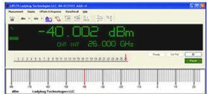
Power Meter Panel