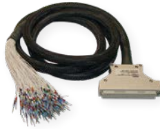
Multiway Cable Assemblies