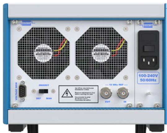
Rear of the 42-924 PXIe Chassis Showing Cooling Air Outlets, Reference Clock Connectors, Voltage Monitoring Port and Power Connector

Two 80mm fans insure maximum PXI module cooling and an efficient direct convection design allows the chassis to operate over an extended ambient temperature range of 0°C to +50°C.